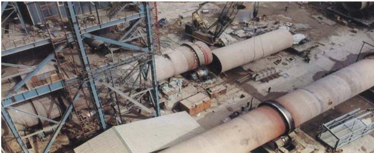
Klin Shell Section Replacement