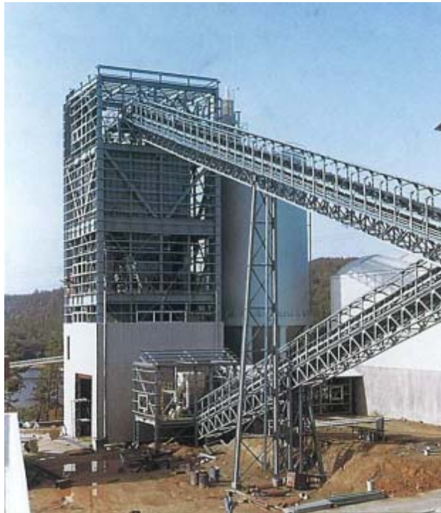
Tower Type (210 m 3 /H)