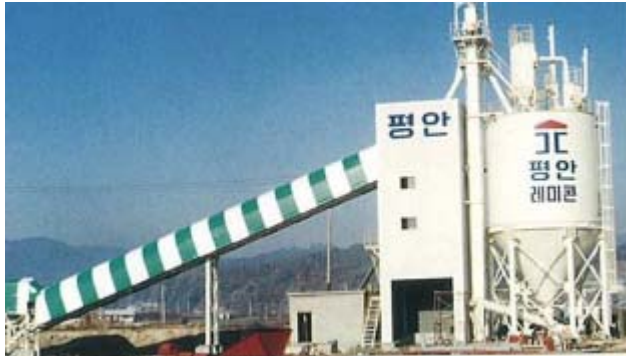
Tunnel Type (180 m 3 /H)