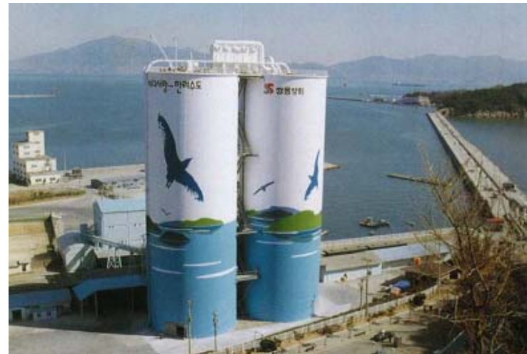
Bulk Terminal (10,000 Ton Steel Silo x 2)