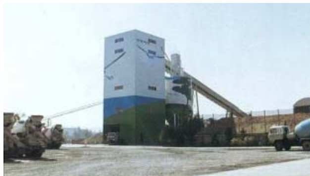
Tower Type (180 m 3 /H)