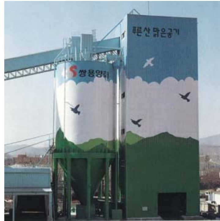
Tower Type (210 m 3 /H)