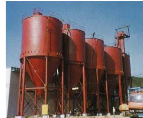
Bulk Terminal (300 Ton Steel Silo x 5)