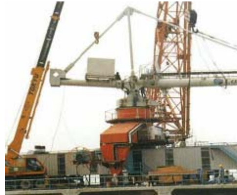
Bulk Unloader (Vertical screw type 450 T/H)