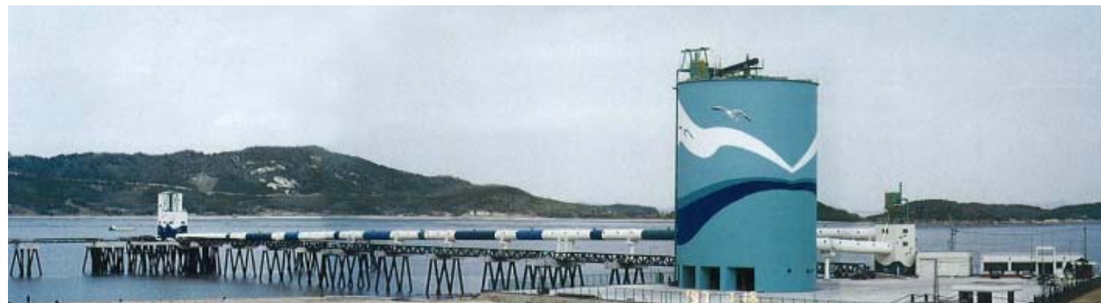
Bulk Terminal (15,000 Ton Steel Silo)