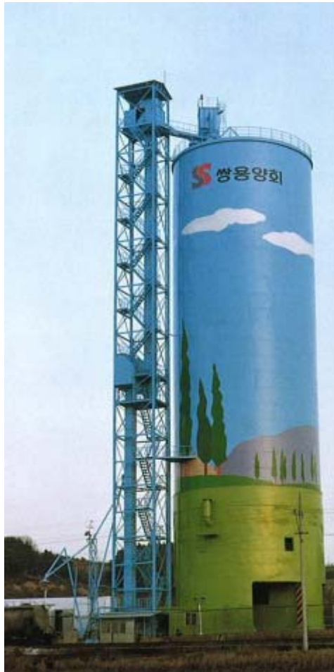
Bulk Terminal (5,000 Ton Steel Silo)