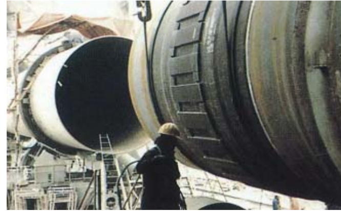
Klin Tire Replacement