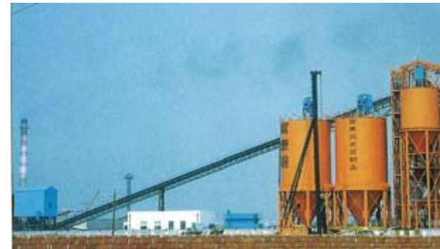
Tower Type (210 m 3 /H)