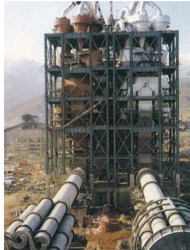
Preheater & Klin/ Cooler