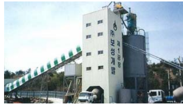
Tunnel Type (180 m 3 /H)